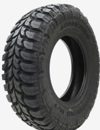
Crosswind M/T Mud Terrain LT235/75R15 104/101Q C Light Truck Tire